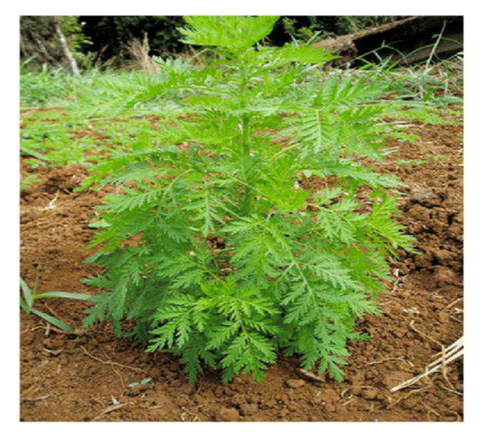
Figure 1: Plant of Artemisia Annua